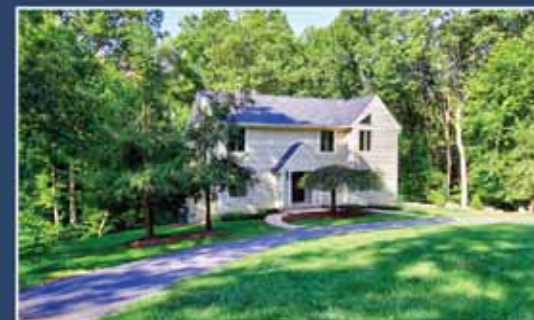
Great Falls $1,050,000