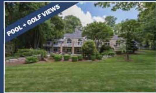
Great Falls $1,799,000