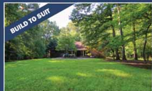
Great Falls $1,199,000