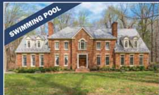
Great Falls $1,699,000