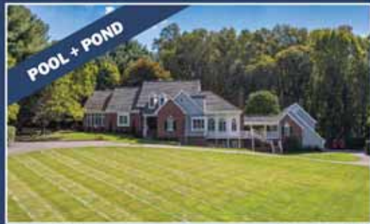
Great Falls $2,499,000