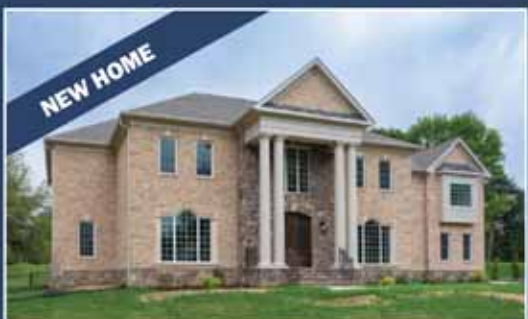
Great Falls $1,749,000