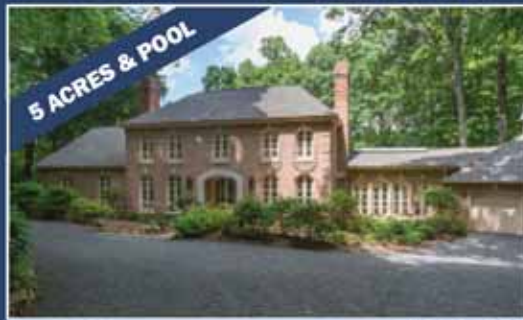
Great Falls $2,499,000