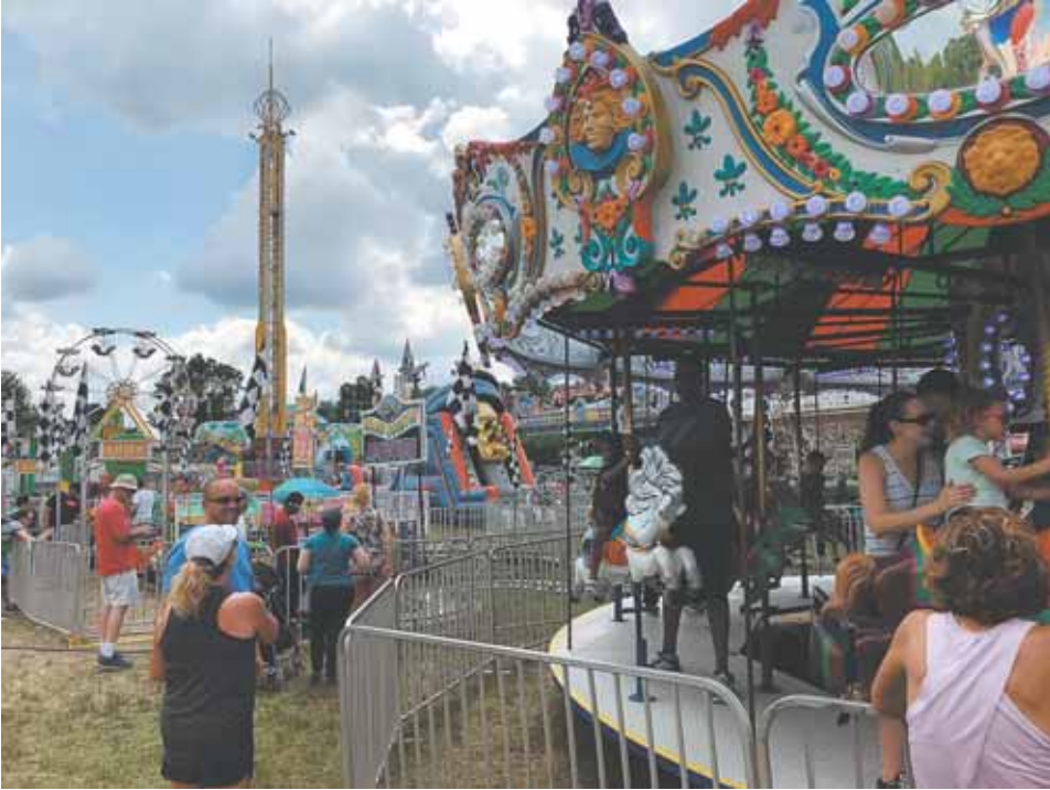
The whirl and twirl of rides by Cole Shows Amusement Company attracted crowds during the Fairfax County 71st 4-H Fair and Carnival held at Frying Pan Park in Herndon.