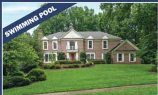
Great Falls $1,399,000