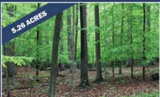
Great Falls $1,199,000