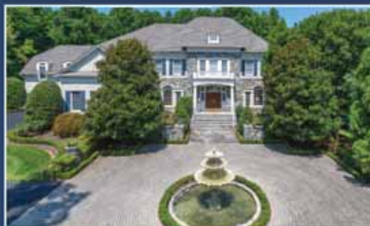
Great Falls $3,499,000