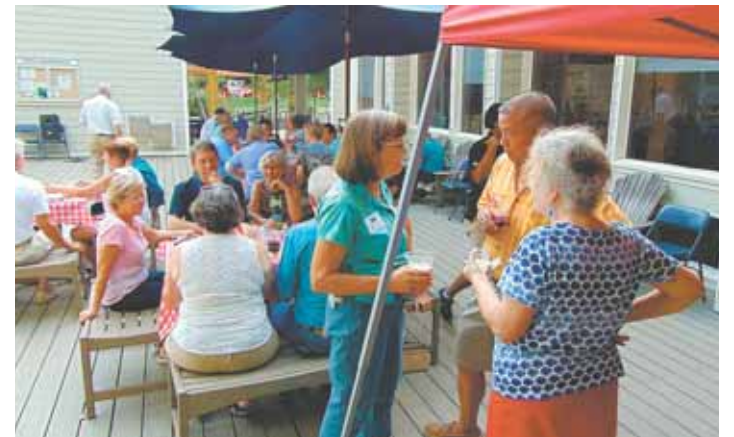
Guests mingle during the 20 th Anniversary Party of the Friends of Riverbend Park at Riverbend Park along the Potomac River on Sunday, Aug. 4, 2019.

He added: "The Friends of Riverbend Park has been a tremendous asset to the Park Authority broadly as well as to Riverbend