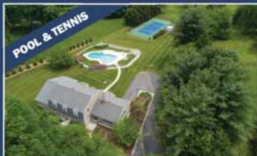
Great Falls $1,199,000